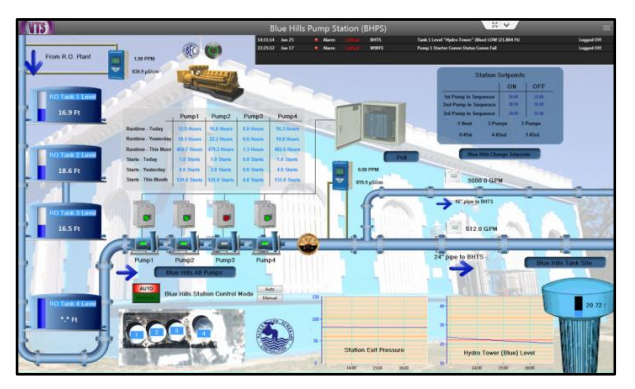
Pump Station Display Created by Star Controls within VTScada

A server installed at the BWSC Control Room hosted the application. "The relationship between Trihedral and Star Controls is what ultimately lead us to choose the software," continues Kusmaul. "The continued support of the entire Trihedral team, specifically Bryan Sinkler, Victor Smeenk, and the support team, is the reason we continue to recommend and use this